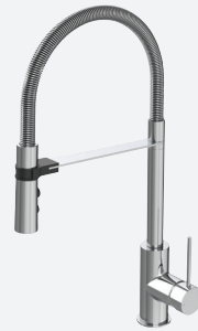
Chrome | LSMC02A